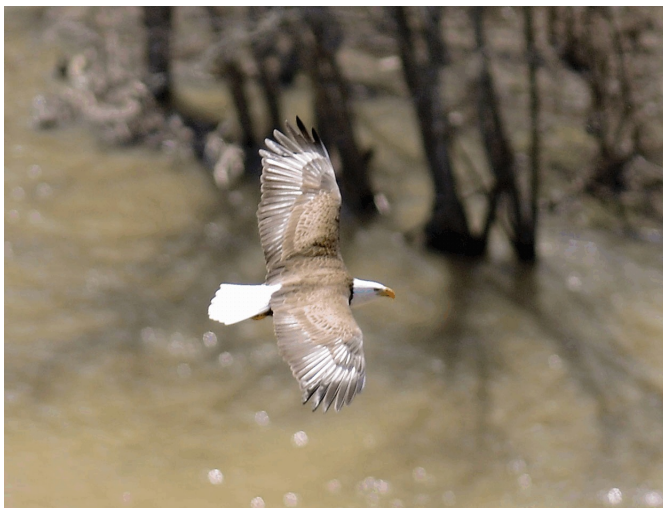
Whitey comes in for his shift at the nest.

A Publication of Three Rivers Avian Center