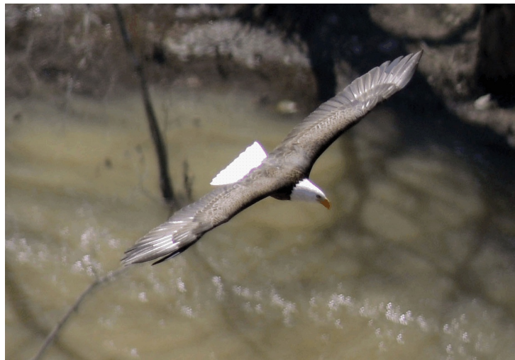
Whitey soars on a hunt near the nest tree on March 19, 2010.