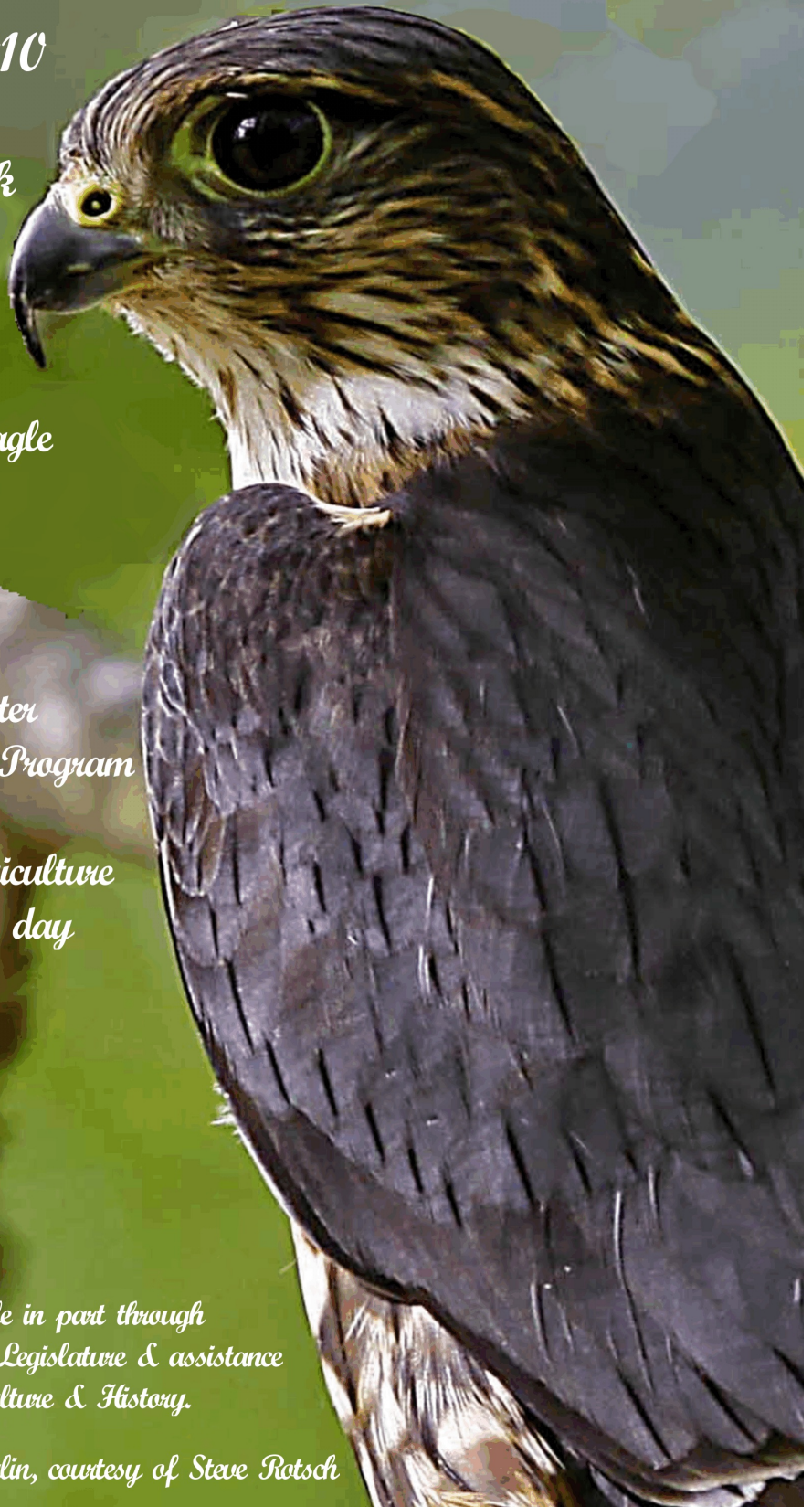
Photo of Jack, the male Merlin

This event was made possible in part through funding from the WV State Legislature & assistance from the WV Division of Culture & History.